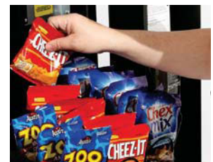
Dispenses All Brand Name Products

Keep your customers happy by with all their favorite chips, crackers, cookies, candy & confections.