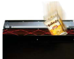
iVend® Guaranteed Delivery System

Keep your customers happy by with all their favorite chips, crackers, cookies, candy & confections.