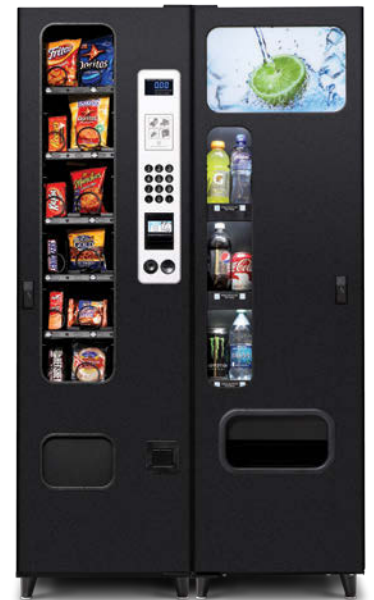
Connects to Compatible Snack Vendor to complement your snack & confection offerings with cold beverages.