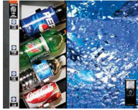
Lighted Live Product Display is easily accessible and allows quick product changes.