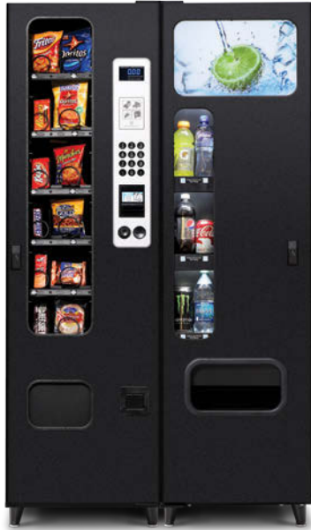
BC6 Satellite Shown with MP12 Snack Vendor