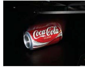
Guaranteed Delivery Sensor System Keeps customers satisfied and reduces service calls for misloaded product.