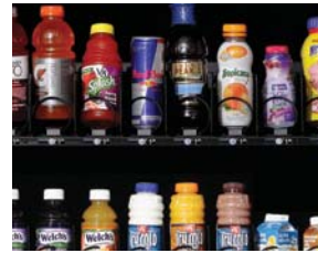
Versatile Steel Beverage Trays

Hold up to 60 canned or bottle beverages.