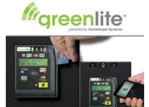
Credit/Debit & mobile reader options.

Hold up to 60 canned or bottle beverages.