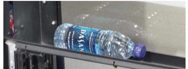
Elevator Gently Delivers a Wide Range of Beverage & Dairy Products