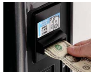
Premium Currency Acceptors

Includes standard electronic coin acceptor and $1 & $5 bill acceptor.