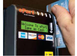
Credit/Debit card reader options.