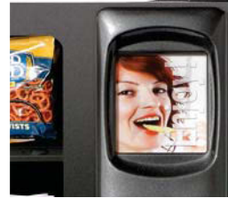
Back lighted point of sale window for advertising and specials.