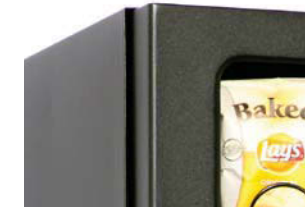
Door-In-Cabinet Design Adds security and rigidity to an already solid package.