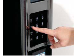
Large and easy to read selection buttons with Braille identification.