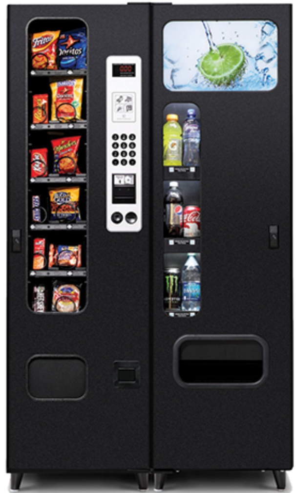
MP-12 NON iVend BC-6 iVend Equipped